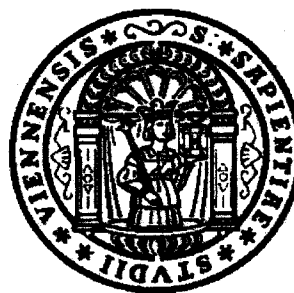
University of Vienna